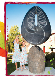
Spin 'The Angel of Hahndorf' at the Hahndorf Academy