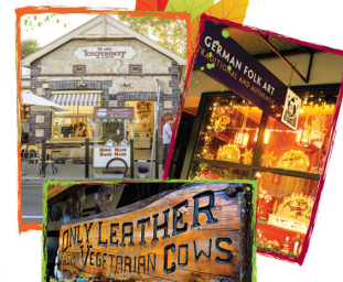
Discover retail delights and enjoy a delicious ice cream