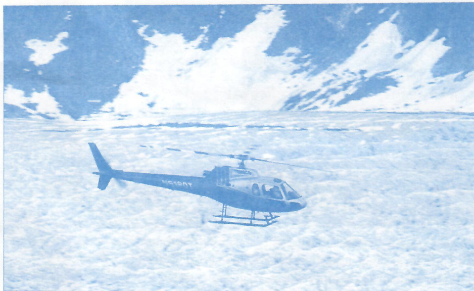
Mendenhall Glacier helicopter tour