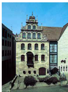
Hallersches Haus (Toy museum)

First mentioned in 1517 as the property of Wilhelm Haller. In 1611, the jeweler Paul Kandler had the facade modified for the first time (probably by Jakob Wolff). The oriel was added in 1720.